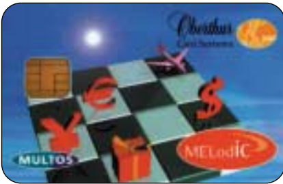
Subscribers will receive Oberthur's Melodic Card free with this issue of Smart Card News.